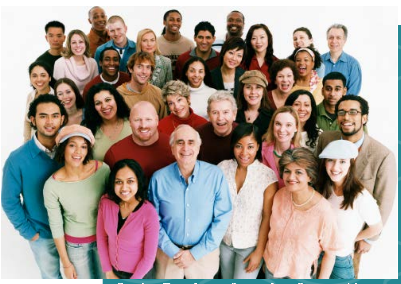
Coming Together to Strengthen Communities

Stakeholder Partnerships, Education and Communication (SPEC)